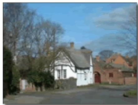
Main Street and Village Hall

We are conveniently located for easy access to Loughborough, Nottingham and Leicester. Loughborough railway station is 3 miles away and is serviced by local transport/taxis. Nottingham East Midlands Airport is 15 minutes drive away.