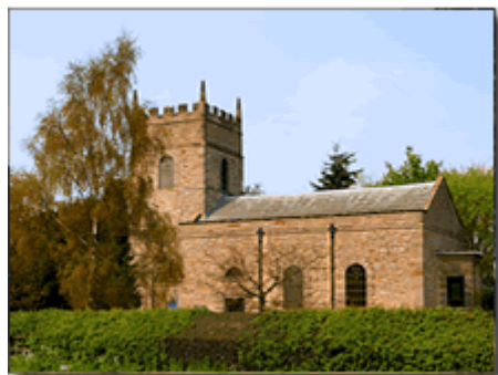
All Saints' Church - Rempstone

The Guesthouse at Rempstone , adjacent to the village church, dates back to the 1890's when it was a Coaching Inn known as the Ship Inn. It has been carefully refurbished and extended to offer 12 large bedrooms, some en-suite, lounge and restaurant. The licensed restaurant, Nightingales, with its extensive wine list, offers fresh home-cooked breakfast and evening meals using local produce wherever possible.